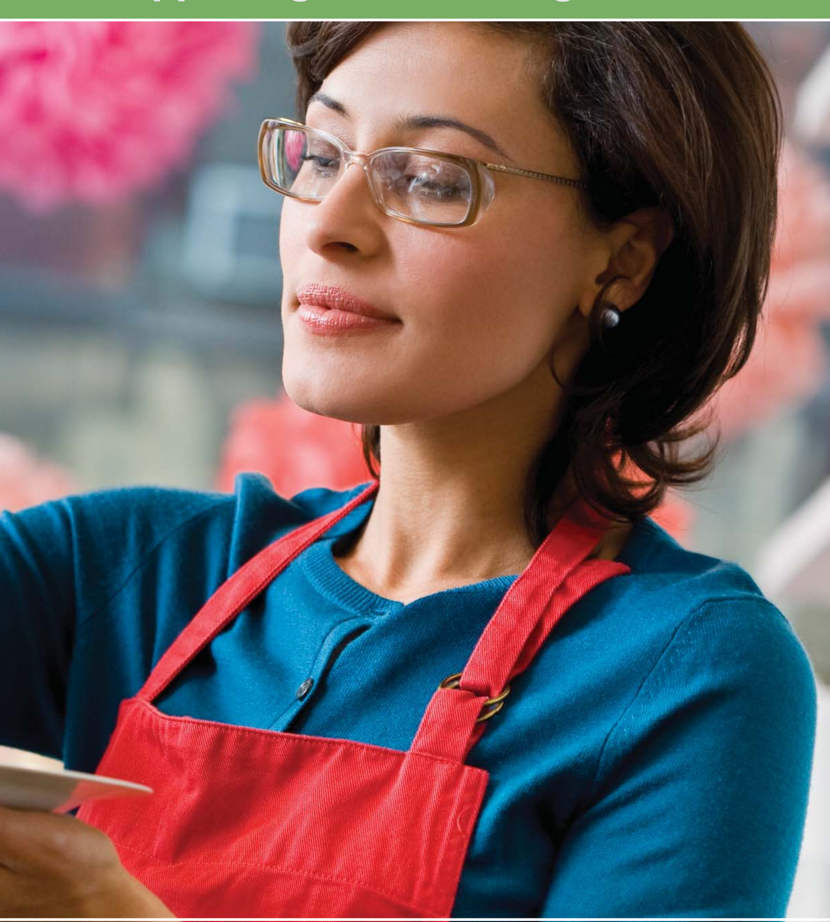
A Guide for Employers